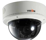
VDA110SM3i-IR 3MP/Full HD