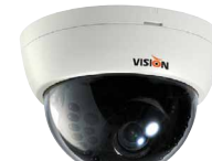
VD101SM3i-IR 3MP/Full HD