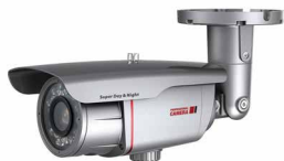
VN7XSM3i 3MP/Full HD