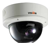
VDA110SM3i 3MP/Full HD