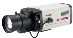
VC58SM3i 3MP/Full HD VC58SMi 1.3MP/HD VC58Si D1