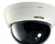
VD101SM3i 3MP/Full HD